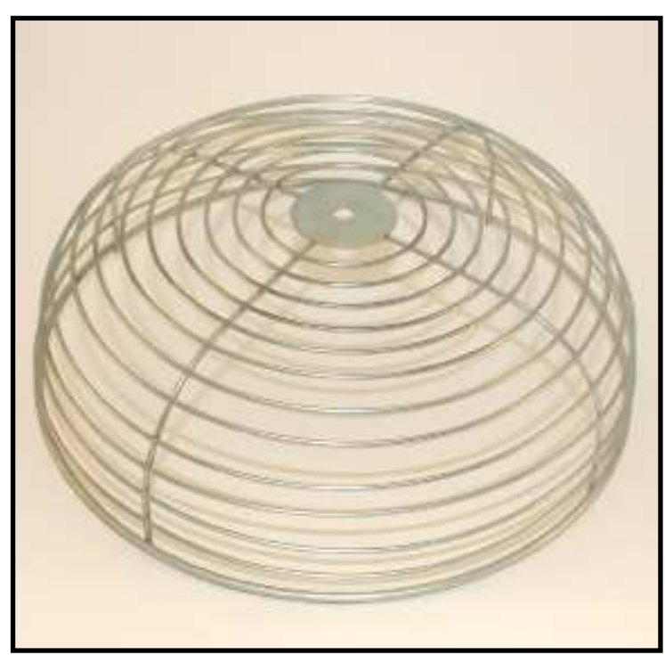
Fire Alarm Bell Protector (Cage)

Designed to protect fire alarm bells from tampering or foreign objects, such as birdnests.