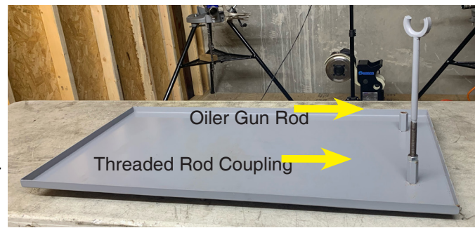
Top side of O'Day Tray