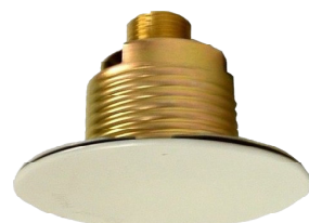
3 5/16" diameter plate