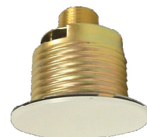
2 3/4" diameter plate

QUICK RESPONSE WHITE ADJUSTABLE CONCEALED PENDENT