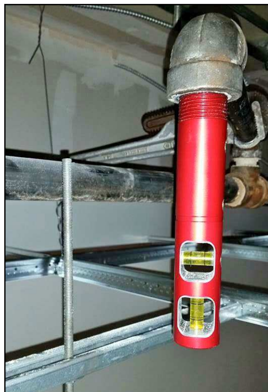
ARGCO ITEM# 3099105

The Spotter level has both 1" male NPT and 1/2" female NPT. It can also act as an emergency plug.